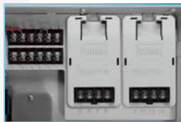
12-station configuration with (2) 4-station modules