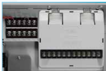
16-station configuration with (1) 12-station module