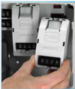
Modular configurations from 4 to 16 stations