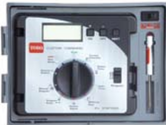
Plastic Wall Mount