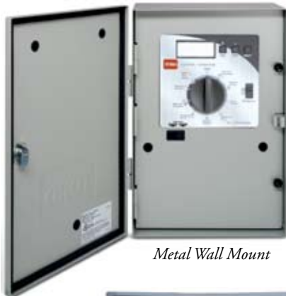
Metal Wall Mount

The Toro Custom Command delivers. With the highest surge protection in its price range, options from 9- to 48-stations, metal or plastic enclosures, and a 5-year warranty, it defines the term "Commercial Grade."